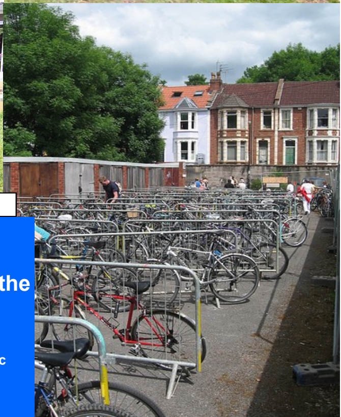
Host a Carbon Neutral Festival