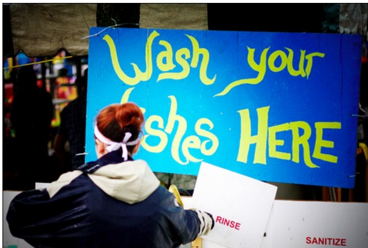
Above: Hillside Festival Dish Washing Station