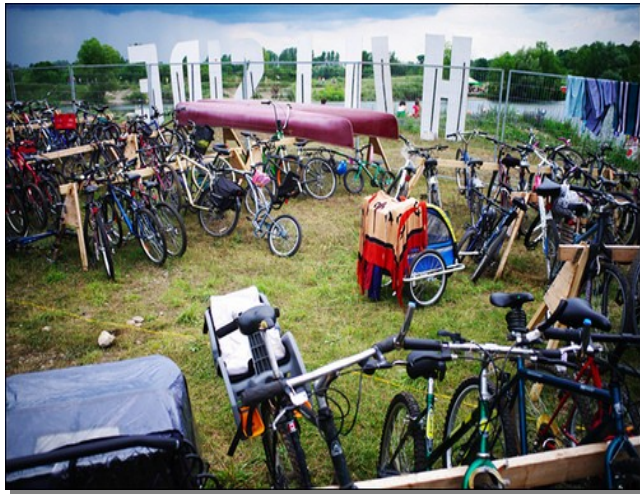
Left: Homemade Bike Racks and Super- vised Bike Park- ing Corral, Hill- side Festival: Photo by Chris Tiese